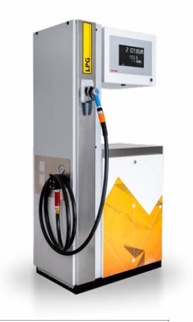
BMP4000.OE EURO/LPG without hose retractors

BMP4000.OE EURO/HR/LPG with hose retractors